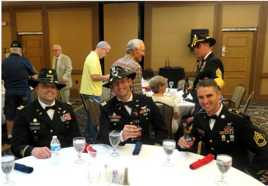
Our distinguished visitors