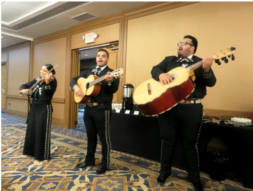
Entertainment at the Banquet - sponsored by the Vikings.